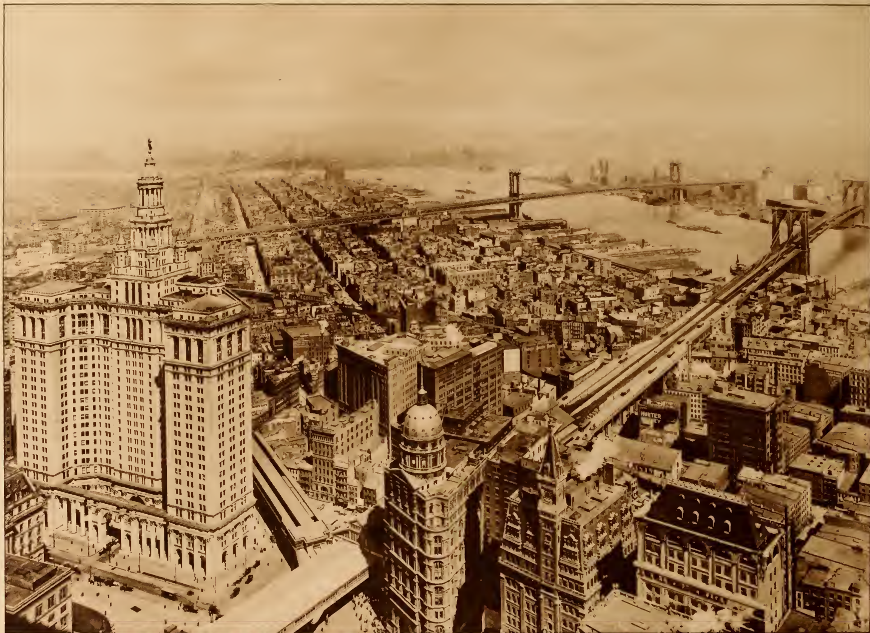
LOOKING EAST FROM WOOLWORTH BUILDING. This photograph affords a good view of the three bridges over the East River. In the foreground is the Municipal Building towering above the office and residential structures in the vicinity. The terminal of the original Brooklyn Bridge, the first one in view, faces the Municipal Building